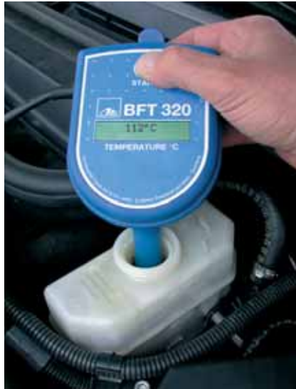
Determine the boiling temperature in the reservoir

Thanks to its handy size and a 12-volt power supply, the ATE BFT 320 is perfect for use in the workshop. It allows you to measure brake fluid boiling tem-