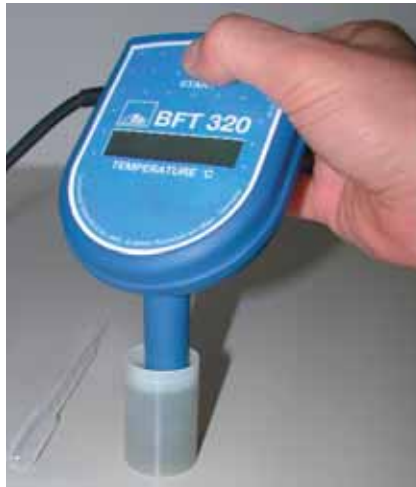
Measurement using a sampling cup

perature directly in the vehicle's brake fluid reservoir or outside the vehicle using the sampling cup and pipette that are supplied.